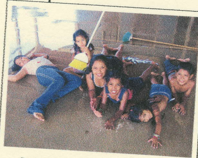
Cooling off while sweeping the patio.

I can't put into words how hard this group worked on the house. It was nonstop for days. The quality of the work was exceptional and the house looks wonderful.